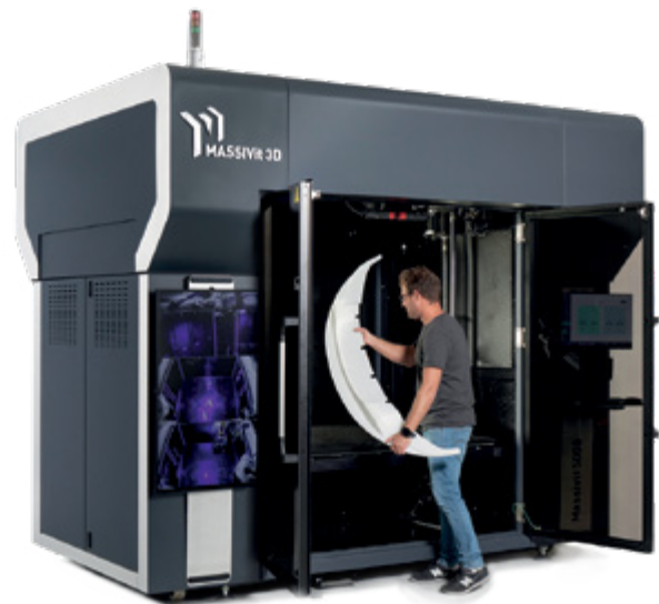
Massivit 5000 Large-Scale 3D Printer

FOR FURTHER INFORMATION ABOUT CUSTOM MANUFACTURING WITH MASSIVIT 3D PRINTERS, PLEASE CONTACT US: INFO@MASSIVIT.COM | WWW.MASSIVIT3D.COM