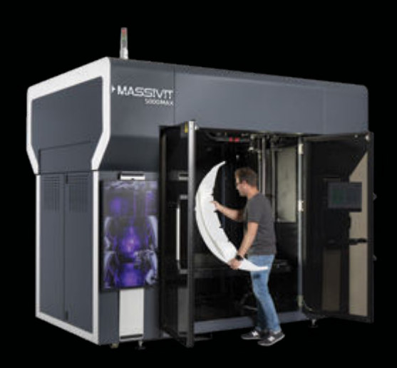
Massivit 5000 Large-Scale 3D Printer

For Further Information About Custom Manufacturing With Massivit 3D Printers, Please Contact Us: